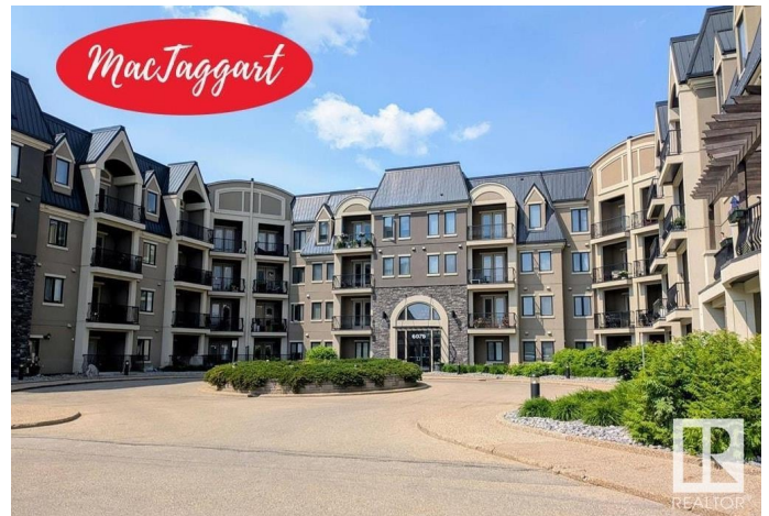
237-6079 Maynard Way NW, Edmonton, AB