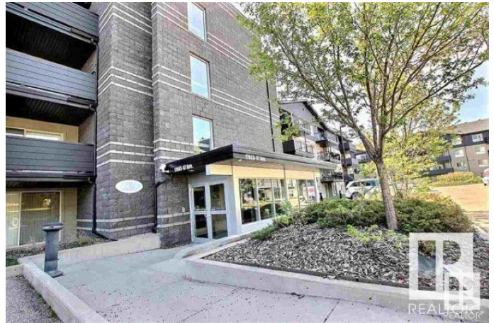
302-17003 67 Ave NW, Edmonton, AB