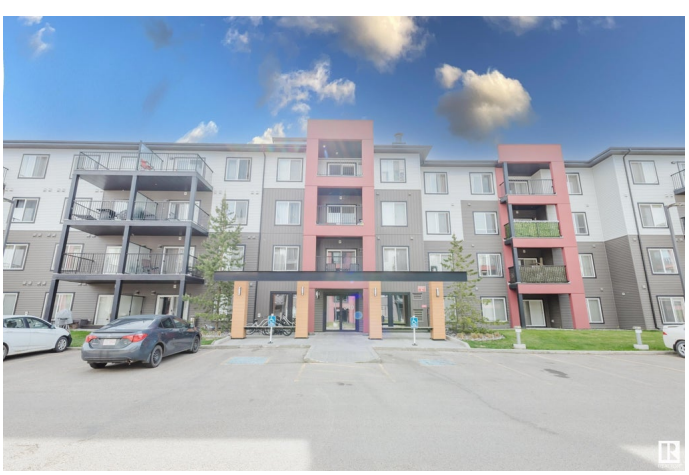
108-340 Windermere Rd NW, Edmonton, AB Main Floor Interior Area 722.75 sq ft