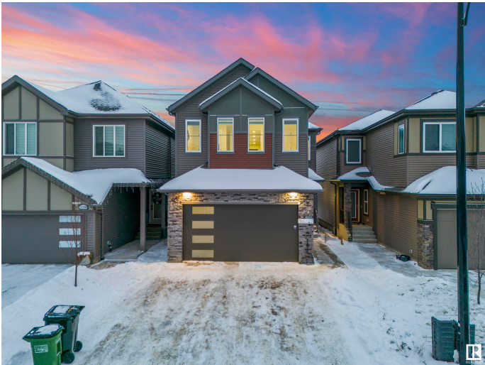
2096 Graydon Hill Cres SW, Edmonton, AB

Discover luxury living in Graydon Hill with this stunning 7-BEDROOM home, featuring high-end finishes, an OPEN TO ABOVE design, and a bright kitchen with a SPICE KITCHEN. The MAIN FLOOR includes a BEDROOM and FULL BATH, while upgraded triple-pane windows enhance comfort. The BASEMENT offers a LEGAL 2-BEDROOM SUITE with a private entrance, perfect for rental income or extended family. Enjoy quartz countertops, included appliances, and a master suite with a spa-like 5-piece ensuite. Close to amenities, scenic trails, and green spaces, this move-in-ready home is an exceptional opportunity!