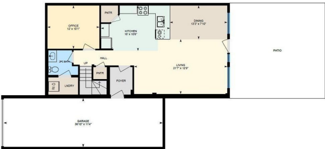
Main Floor: Interior Area 856.69 sq ft Excluded Area 415.67 sq ft