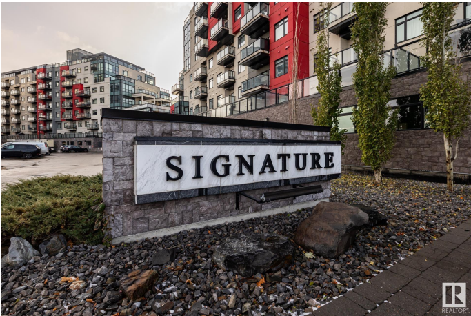
Main Building: Total Interior Area Above Grade 1442.81 sq ft